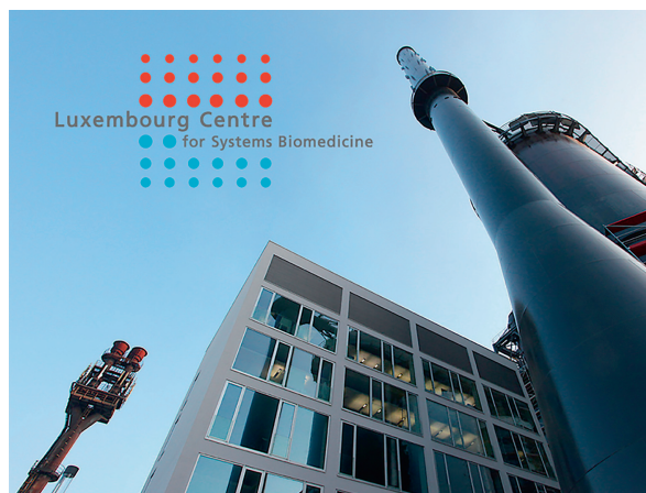
Figure 4 A photo of the Luxembourg Center for Systems Biomedicine—a center ISB played a fundamental role in creating

We proposed to build a Luxembourg Center for Systems Biomedicine (LCSB) at the newly-formed University of Luxembourg, where ISB would recruit the director, help recruit faculty, and train 11 postdoctoral fellows in the science and technologies of ISB who would return to LCSB. ISB faculty would collaborate with LCSB on science, technologies and computational biology and we also would create a network of outstanding, interacting scientists across the European Union (EU) and United States (USA) to assist in this effort. We succeeded in each of these endeavors and today LCSB is one of the leading life sciences institutions in the EU (Figure 4). This was done in about three years with the major contributions from ISB—and it could never have been done without ISB’s leadership. In return, we proposed that Luxembourg provide $100 million over five years for ISB to invent the tech-