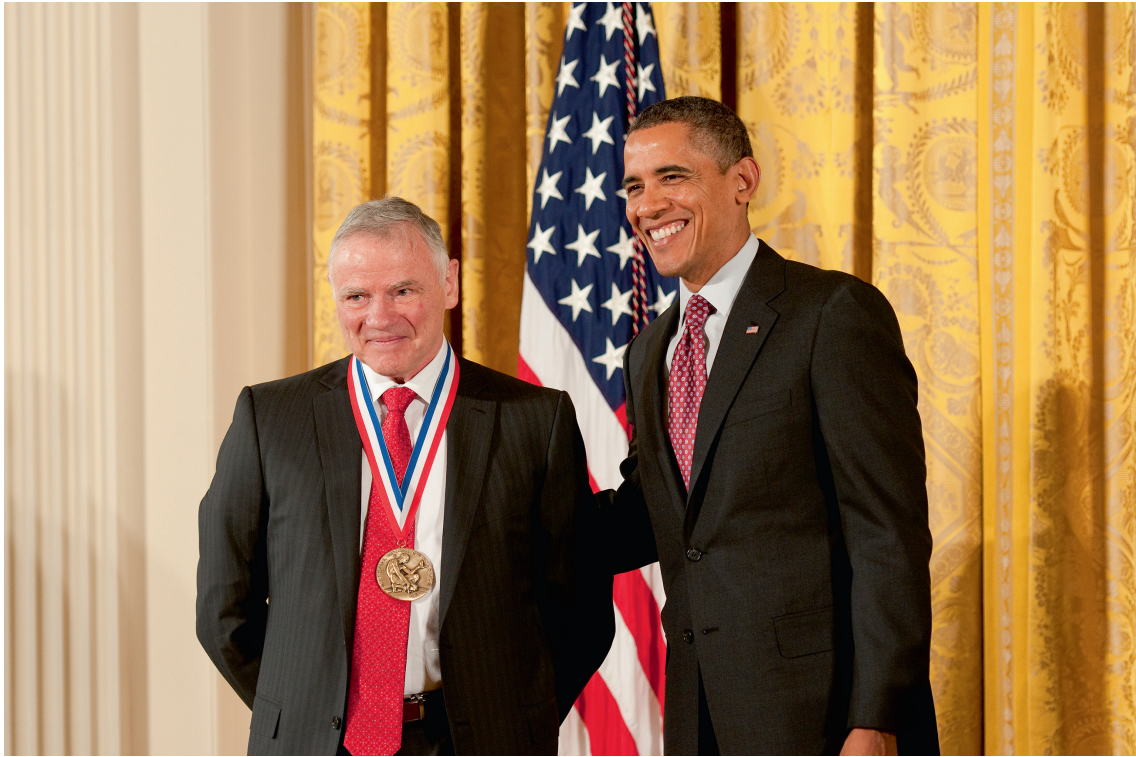
Figure 5 A photo of Leroy Hood and former President Barack Obama during a 2013 White House ceremony awarding the National Medal of Science

coaches or physicians make his/her own decisions about his/her health. Precision medicine, born with Obama's State of the Union Address in 2015, employs big data (mostly from genomics) and digital health to target disease. For example, one of the most "successful" examples of precision medicine is the DNA sequencing of tumors to identify cancer driver mutations that might have complementary drugs—which can then be employed to attack the tumor. One irony about precision medicine is that medicine is mostly not precise—indeed, precision does not define at all what type of medicine it represents. The contrast between P4 medicine (healthcare) and precision medicine is striking. P4 medicine is systems driven and embraced the study of wellness and disease in the context of the individual. In addition, the four Ps describe the ideals of what we want our healthcare systems to provide—predictive, preventive, personalized, and participatory. P4 is the very essence of 21st-Century Medicine. In contrast, precision medicine focuses entirely on disease—employing the reductionistic approaches of 20th-Century Medicine, while adding the power of big data and the devices of digital health. Indeed, one would argue that the personal, dense, dynamic data clouds that scientific wellness pioneered in 2014 represent the very essence of what precision medicine of 2015 should be.