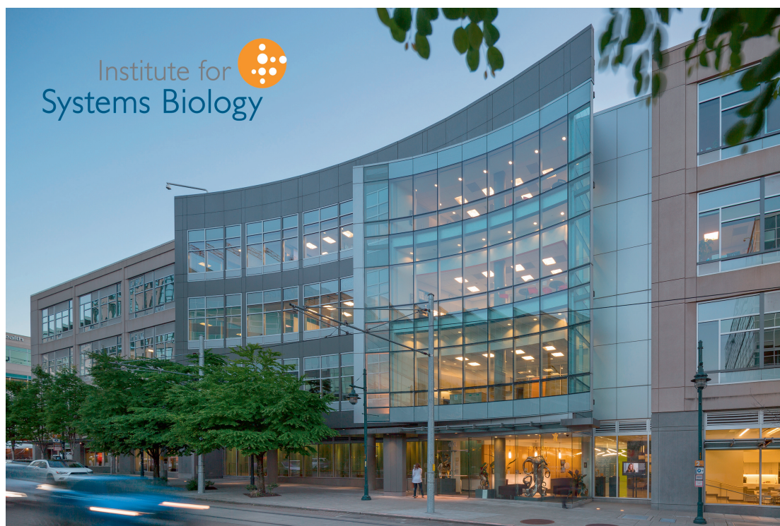
Figure 2 A photo of the ISB building located at the South Lake Union

the integration of big science projects, the exploration of new scientific directions, the support of activities to create a systems-biology-driven culture, and the training of students at all levels. The Center provided the glue that really facilitated interactions and the evolution of a systems-driven culture. John Aitchison did a marvelous job as the most recent director.