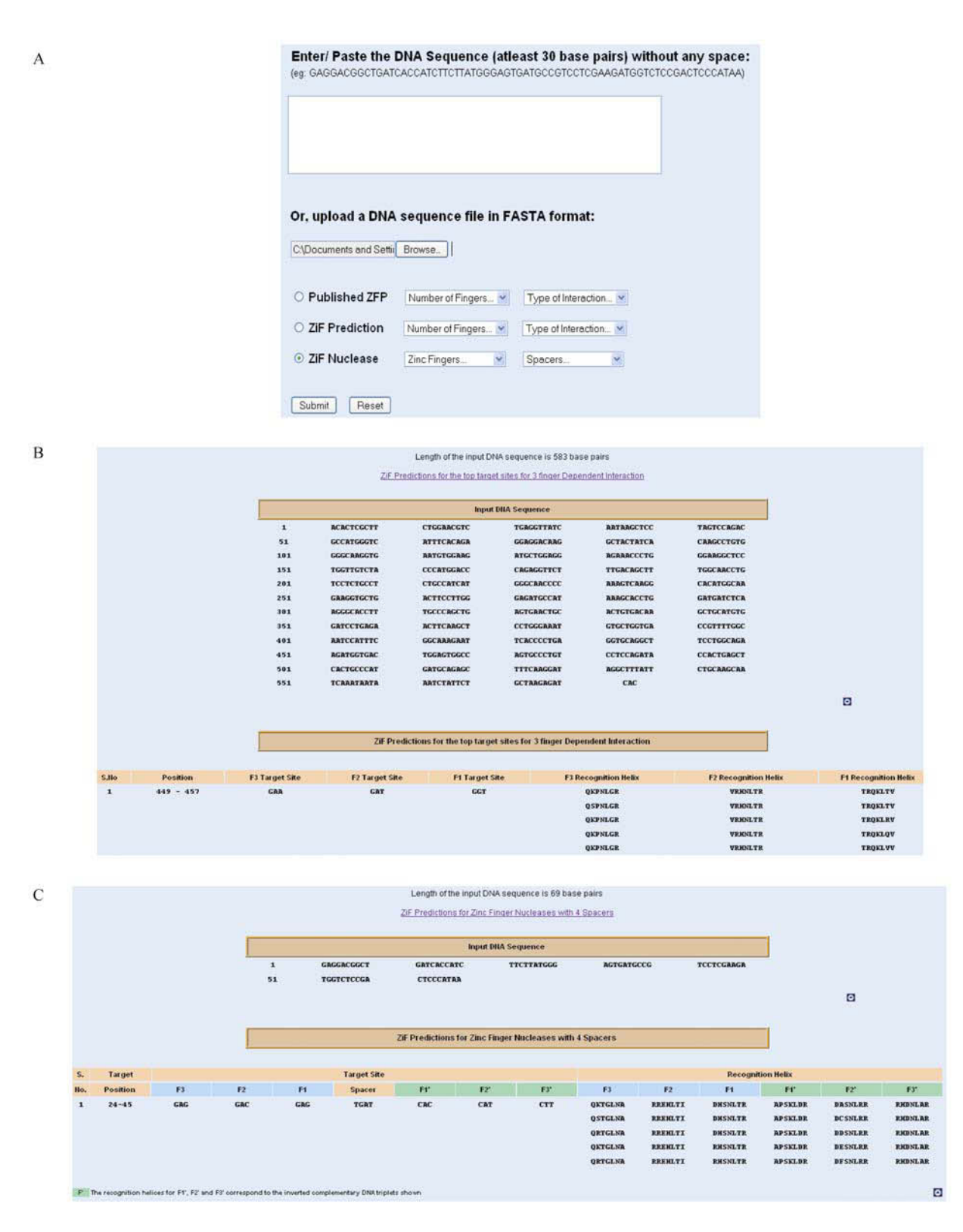
Figure 2 Results of ZiF-Predict using the input DNA sequence. A. Sequence input page. B. Result page showing the best ranked ZFP recognition helices, based upon hydrogen bonding and van der Waals forces between amino acids at positions -1, +3 and +6 and their corresponding target DNA (specific interactions). C. Result page showing the recognition helices for ZFNs comprising of two 3-zinc finger proteins separated of user-input spacer length.

Genomics Proteomics Bioinformatics 2010 Jun; 8(2): 122-126